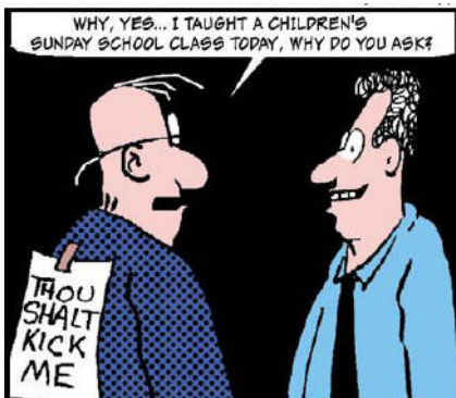
Sometimes the teacher learns more when teaching than the students do!